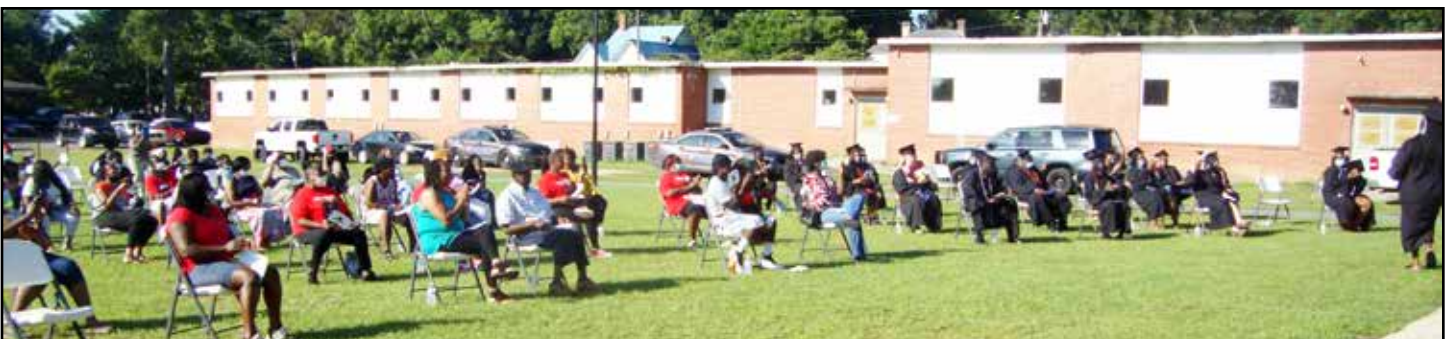
Parents watch and take pictures as their graduates receive the long awaited diplomas.