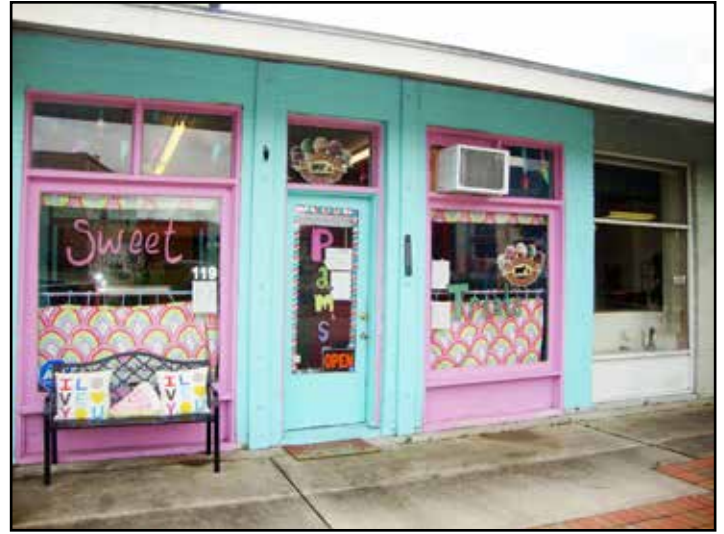
Pam's Sweet Treats at 119 Cherry Street, Montezuma

Call 478-662-7449 to place your order. Her business is doing